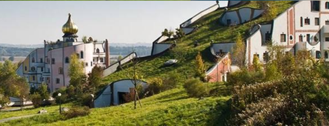
Hotel Rogner, Bad Blumau Babytherme, Lutzmannsburg Alpentherme, Bad Hofgastein